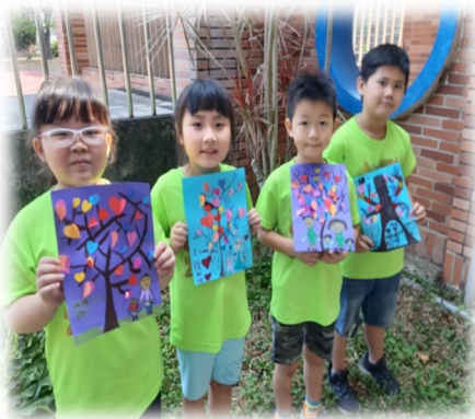
Art & Craft Class