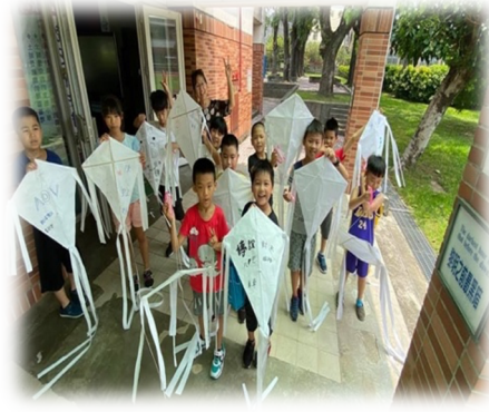
Happy Summer Camp