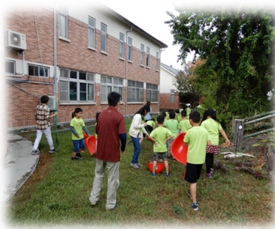
Clean School Environment