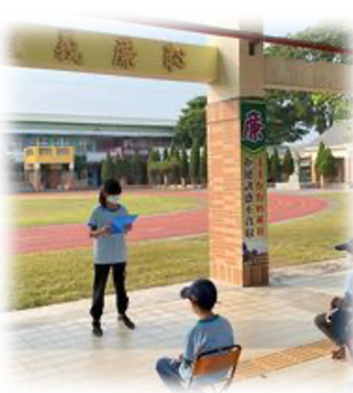
School Storytelling Contest