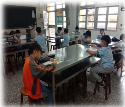
Monthly Spelling Bee