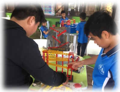
Creative Block Club