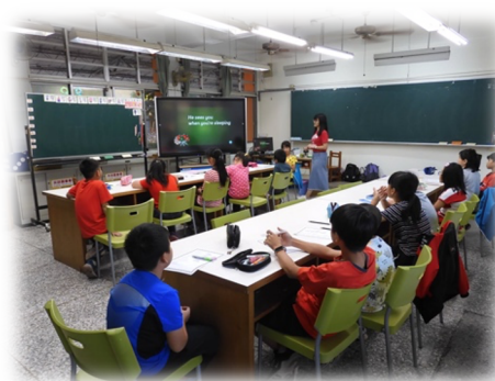
English Conversation Club